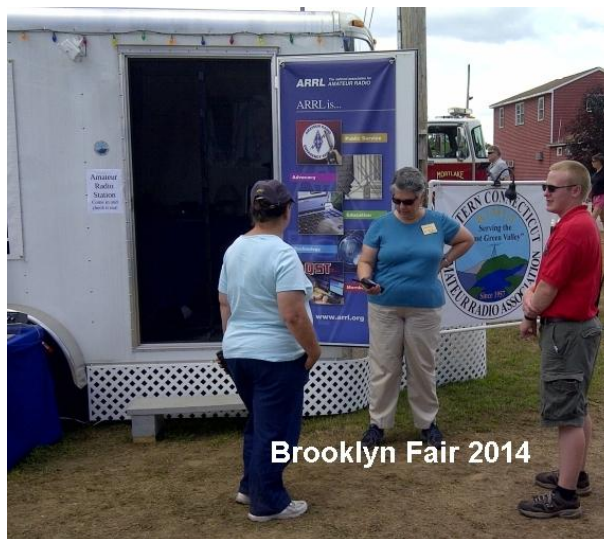
Brooklyn Fair 2014